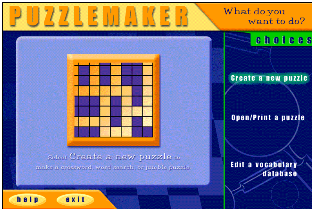
Figure 1 – PuzzleMaker Main Menu